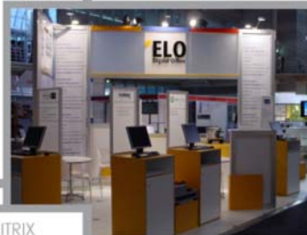
ELO Digital Office