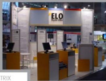
ELO Digital Office